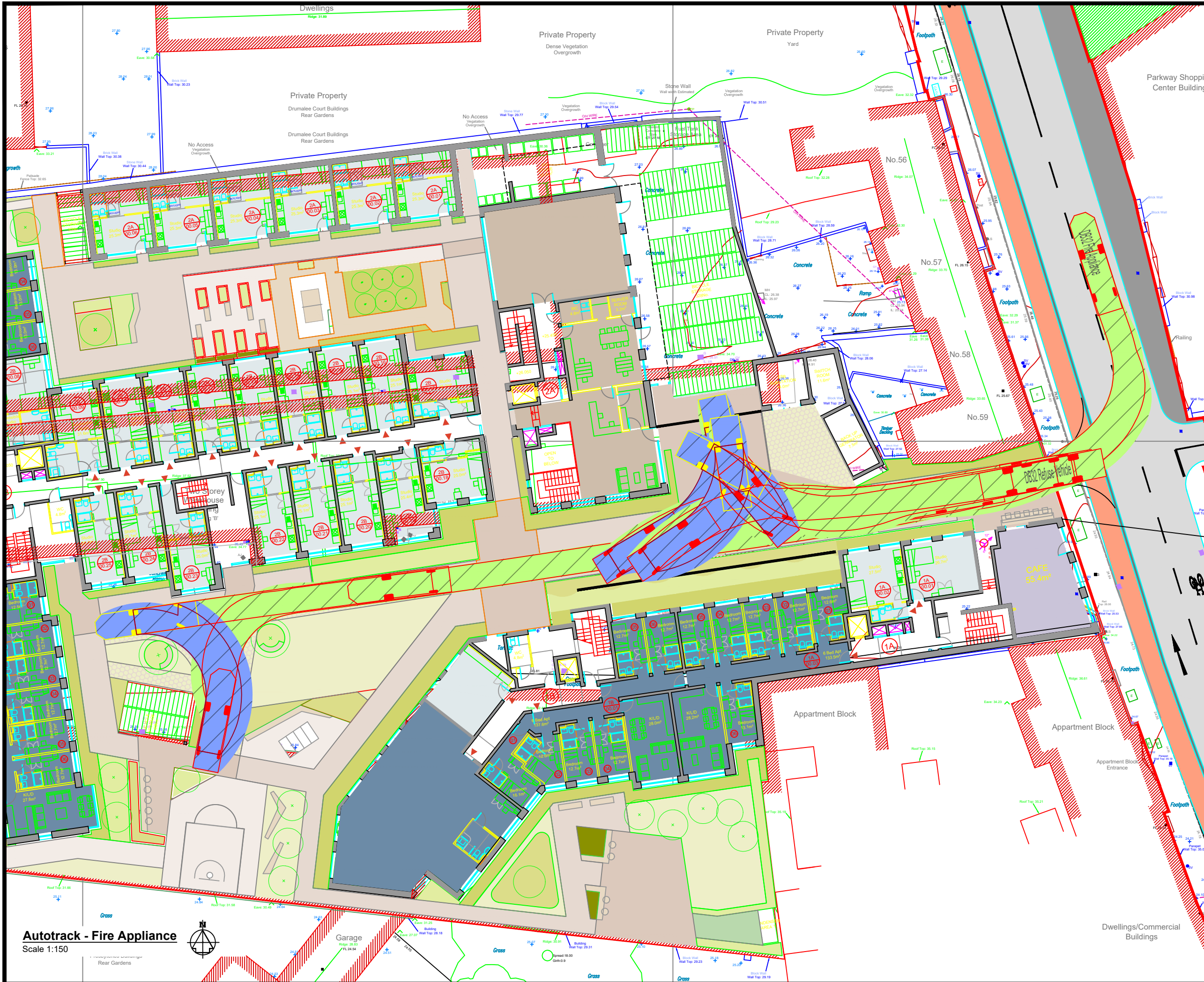
Autotrack - Fire Appliance Scale 1:150